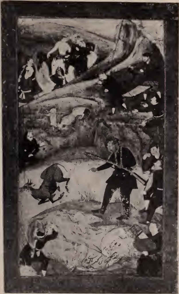
MOGUL PICTURE, DEPICTING THE EMPEROR JEHANGIR ON A SHOOTING EXPEDITION (SEVEN- TEENTH CENTURY).